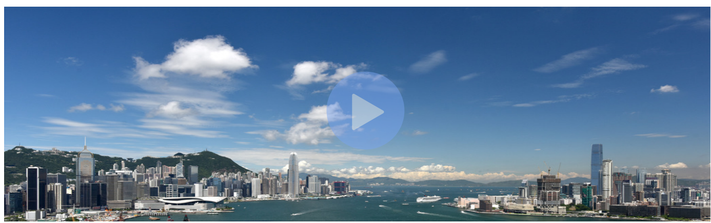
~Click PLAY for a quick glance of Hong Kong's Logistics and Maritime Business-